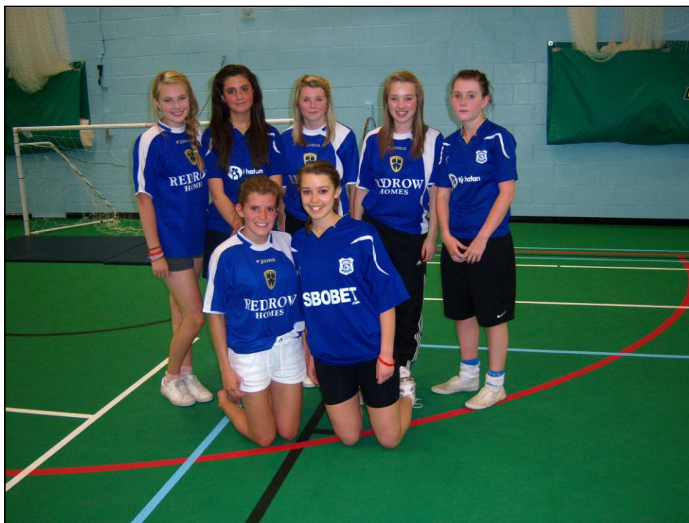
One of the girls teams at the 5 a side tournament – in Cardiff City shirts.