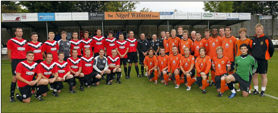
The line up at Brighouse on 16 th August